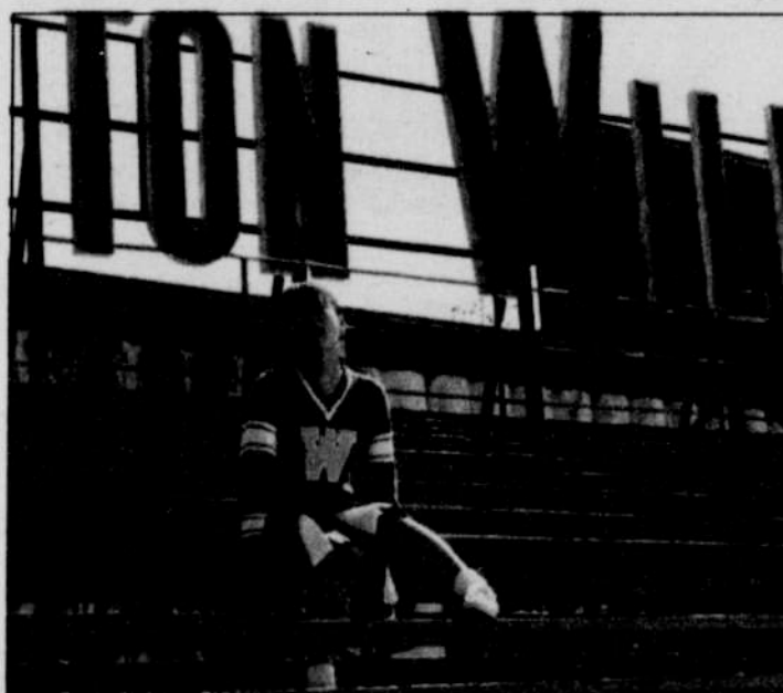
Three cheers for Across the Universe .

Bible bangers boycotted The Golden Compass for fear that it would lead children down the perilous path to atheism, but the harmless fantasy film should've been the least of their worries. There Will Be Blood ends with a gory climax in which a desperate preacher is fooled into admitting: "I am a false prophet! God is a superstition!" The Simpsons Movie poked fun at religion, too: While frantically flipping through the Bible, Homer exclaims, "This book doesn't have any answers!"