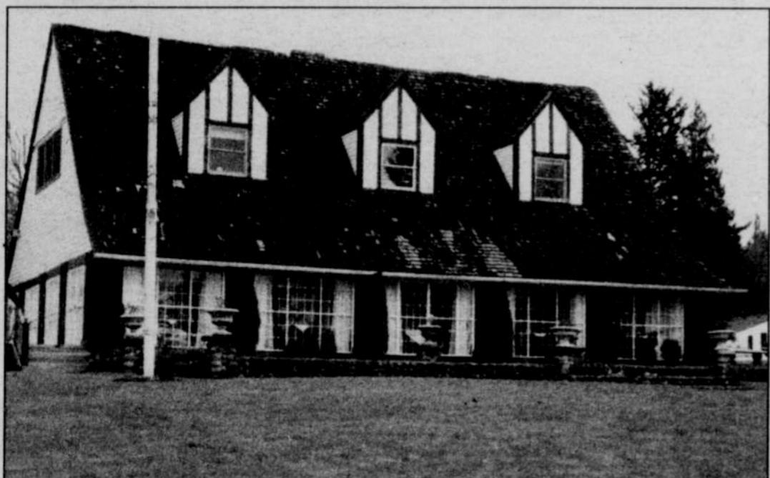
The inn was the subject of a controversial preservation dispute for eight years.