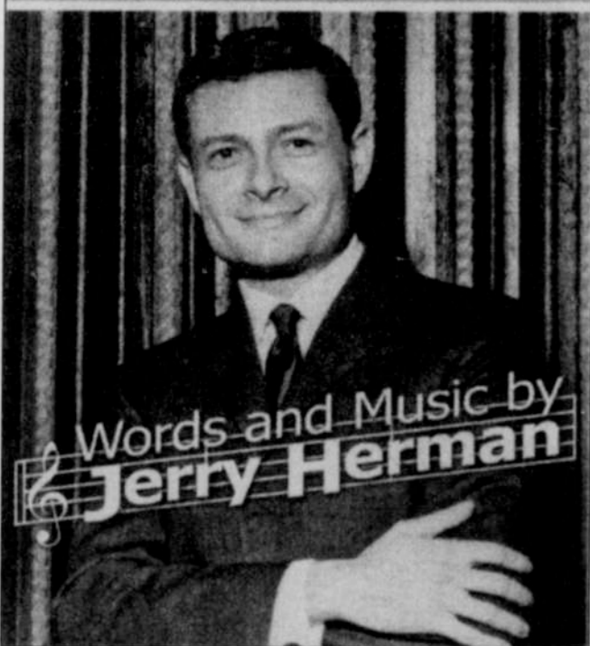
Jerry Herman would like to resurrect Dear World and is working on a new book.

HELLO, DOLLY! • MAME • MACK & MABEL • LA CAGE AUX FOLLES