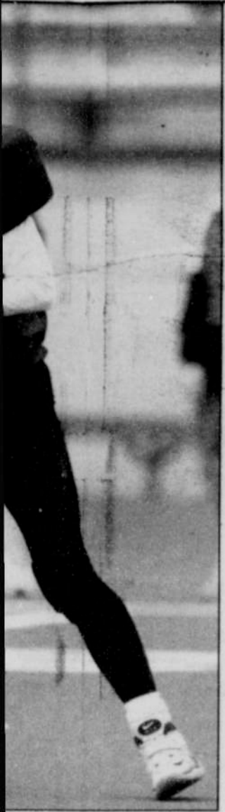
Football team holds