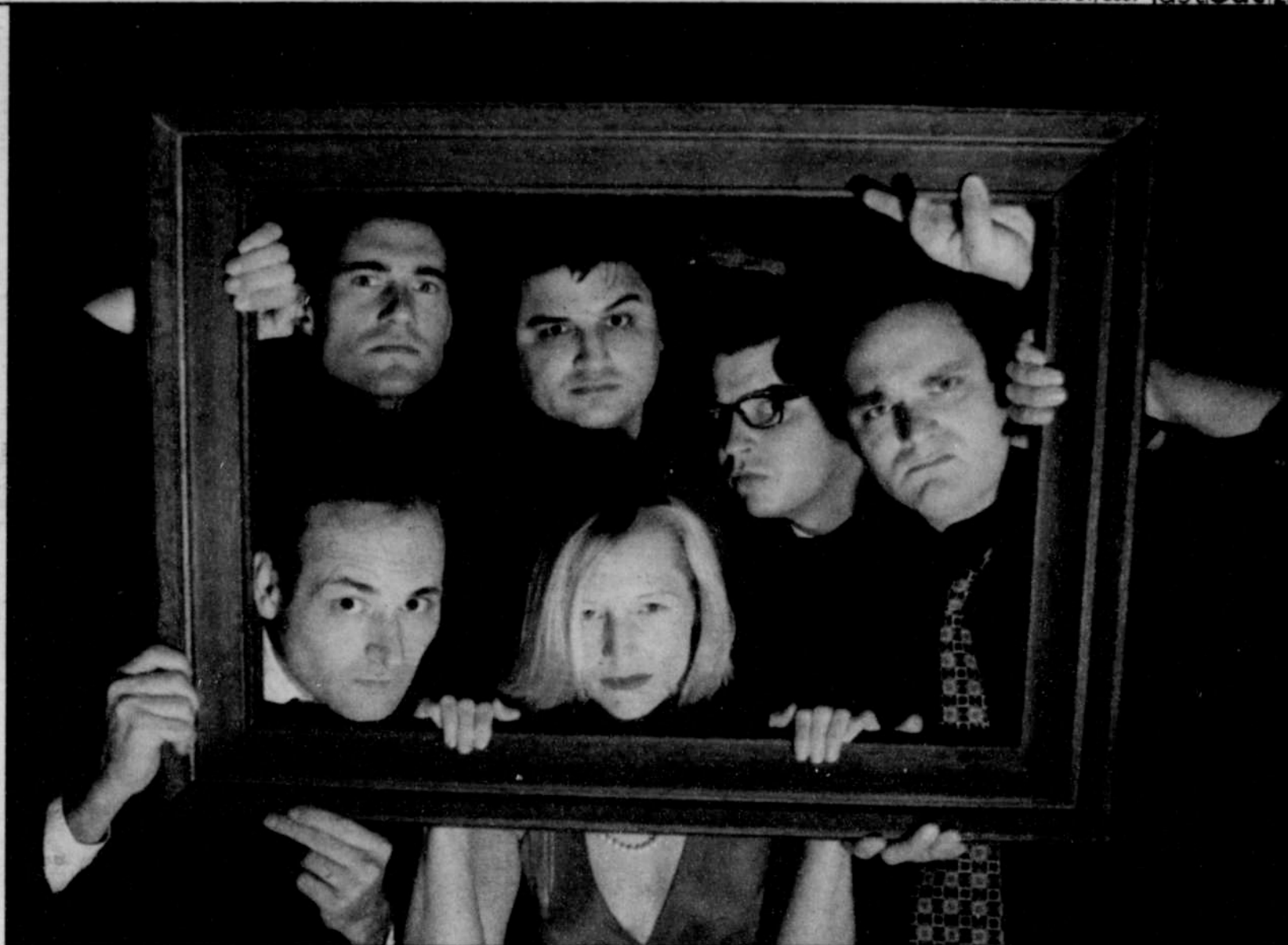
Blue Door Productions stages The 3rd Floor's Gone in 60 Sketches Dec. 29.

ar Divas W Davis church of festive d 11 pm.