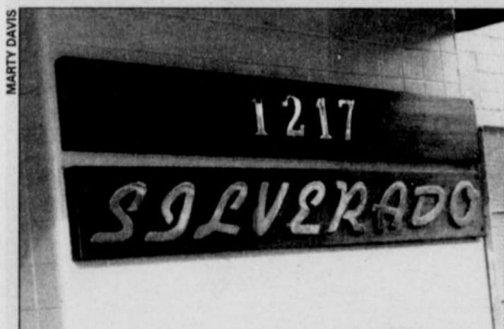
Silverado patrons will walk to the bar's new location at 318 S.W. Third Ave. on Jan. 1, 2008.

I t was the end of a short-lived era in Portland's queer history when Sissyboy took the stage for the last time Oct. 6 at Holocene.