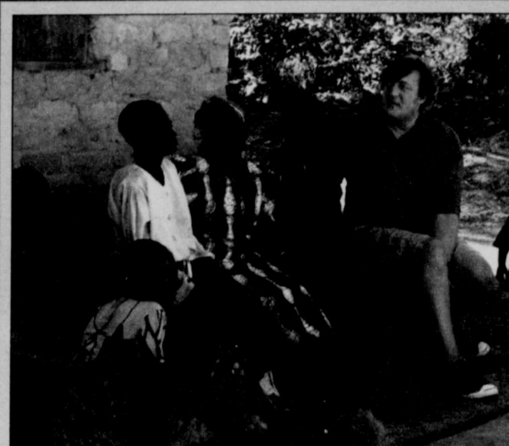
Stephen Fry meets the Rakai family in the documentary HIV & Me .