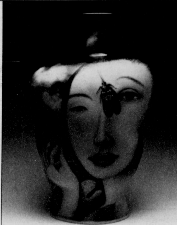
Museum of Contemporary Craft exhibits Eden Revisited: The Ceramic Art of Kurt Weiser through Jan. 6, 2008.