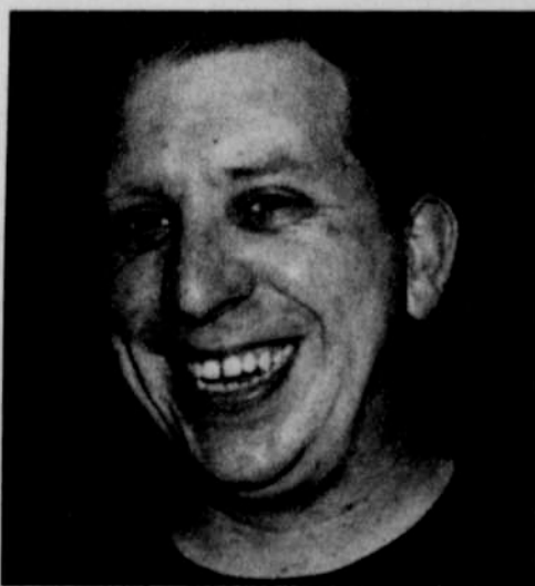
DAN WHITE Energetic

Given the attacks on gay people, it should be "Happy to Be Gay."