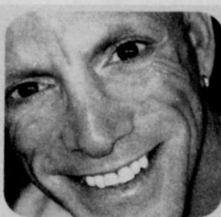
Out Going BY FLOYD SKLAVER

Included with the game was a four-course meal prepared by the statuesque Celeste, whose 6-foot-3