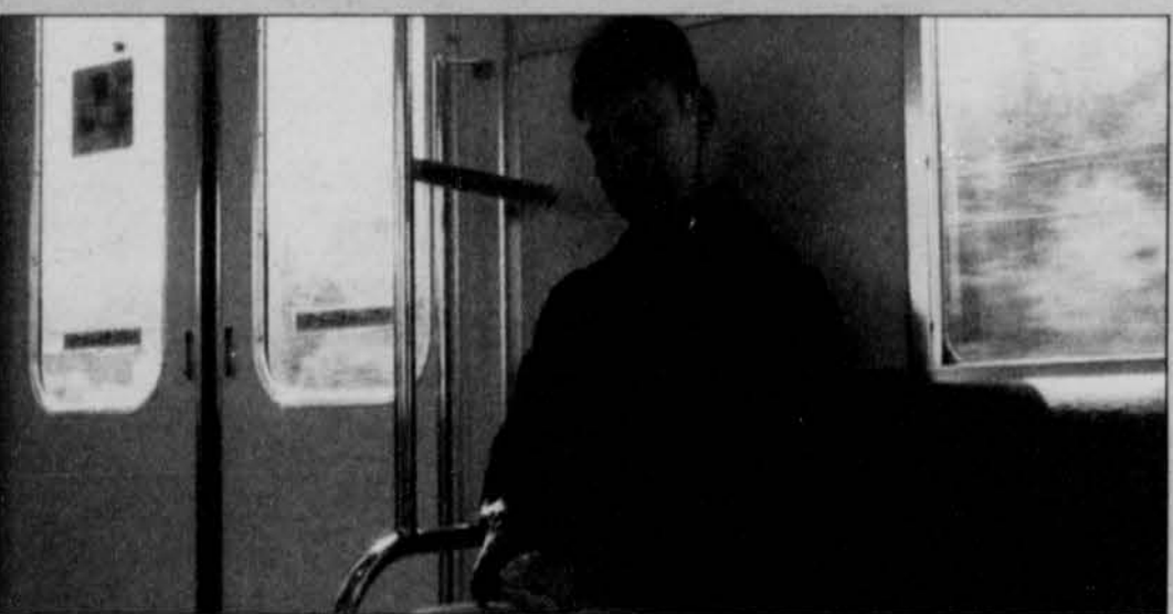
Ken struggles with depression in Does Your Soul Have a Cold? premiering Oct. 22 on IFC.