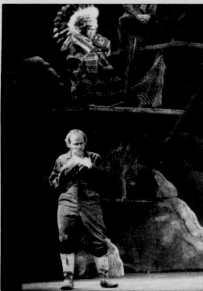
Ghosts share a mystery across a cultural divide in Artists Rep's The Ghosts of Celilo through Oct. 14.

FF The 100th Monkey Studio presents the group show Transitions through Oct. 30. (110 SE 16th Ave.)