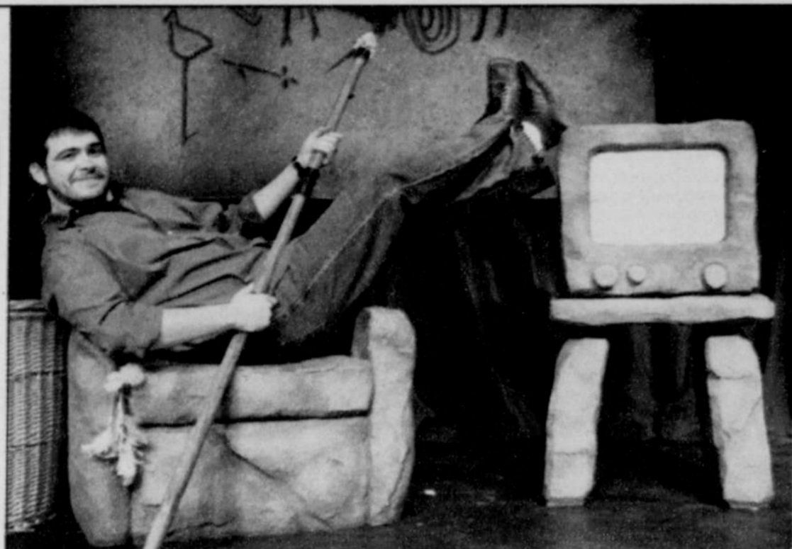
Portland Center for the Performing Arts presents Defending the Caveman Oct. 12-20.