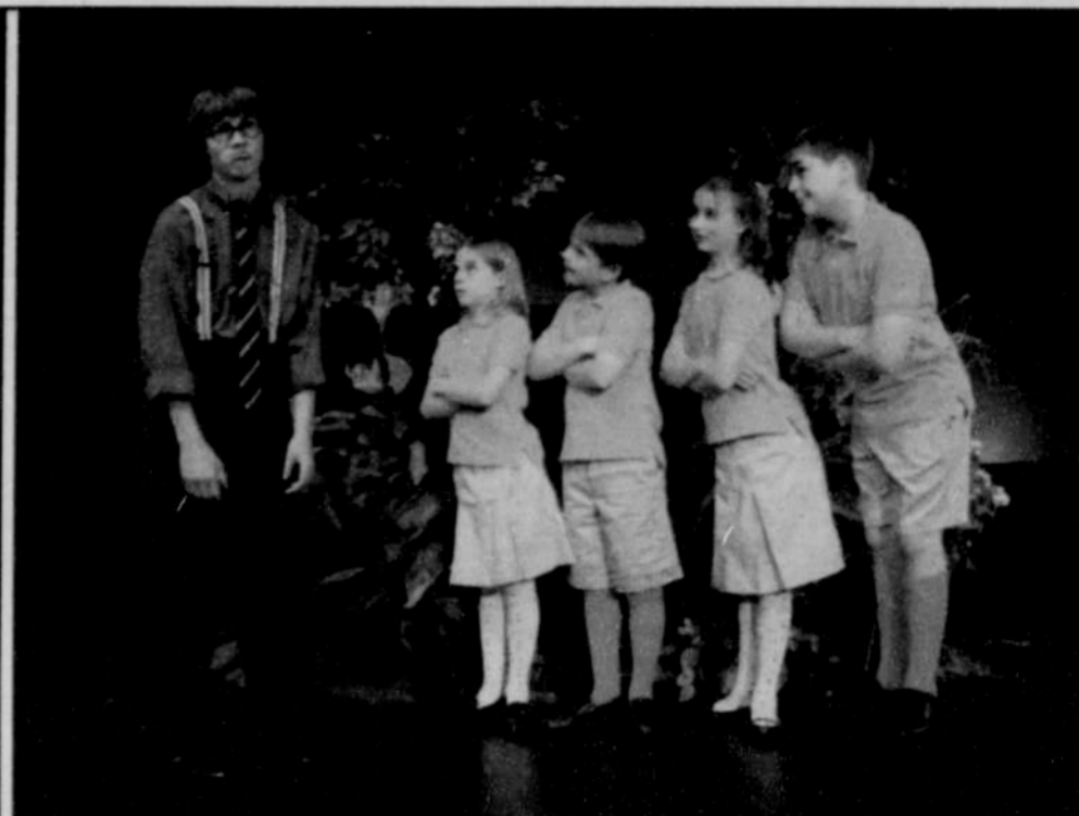
Northwest Children's Theater stages Honk! The Ugly Duckling Musical through Oct. 28.

LT Goodfoot Lounge presents the group show I Am, Therefore I Think through Oct. 23; proceeds benefit Community Alliance of Tenants. (2845 SE Stark St.)