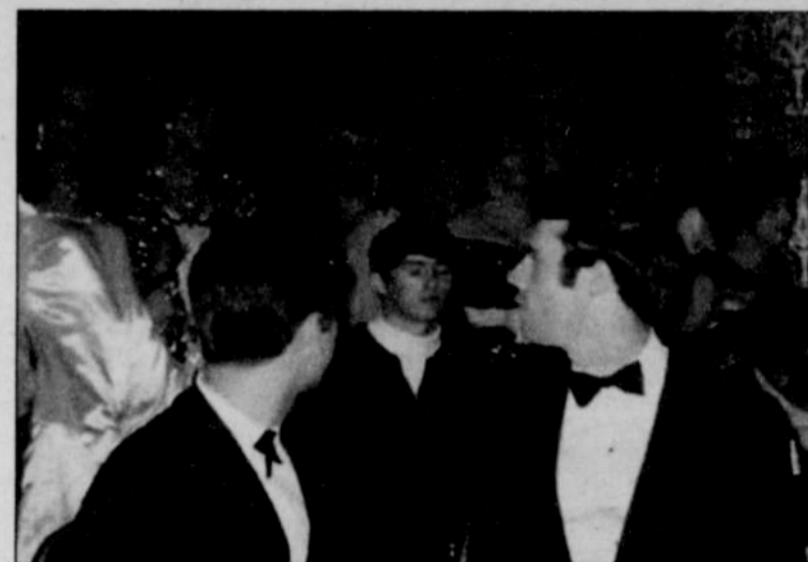
The Old Masonic Lodge (now Portland Art Museum) hosts Coronation 1968. This was one of the last years that "Queens" (now called Empresses) were elected twice a year and served for just six months. Today, titleholders are elected for one-year terms.