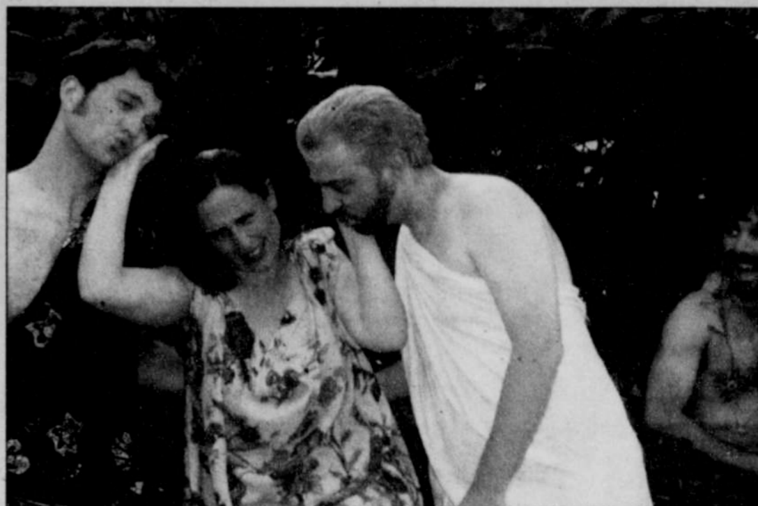
A Midsummer Night's Dream celebrates the joy of finding unexpected desire.

Theatre Vertigo presents A Doll's House , Henrik Ibsen's classic in which a woman's forgery of her husband's signature sets into a motion a series of events that call into question the validity of their marriage, through Sept. 22 at Theater Theatre. (8 pm Thursday-Saturday. 3430 SE Belmont St. $15 from 503-306-0870; Thursdays are "pay what you will.")