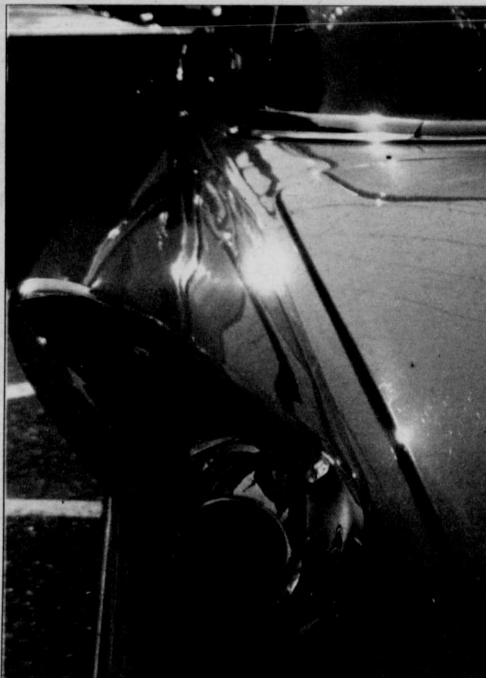
The Antique Car Cruise In will showcase priceless beauties.