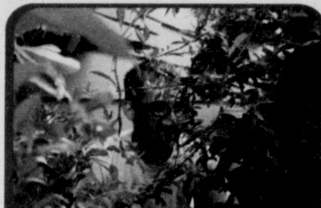
Get Dirty with Dan BY DAN YOUNG

I have heard from folks that dump their coffee grounds around their plants. Another way is to score some aluminum sulfate, which is available at many nurs-