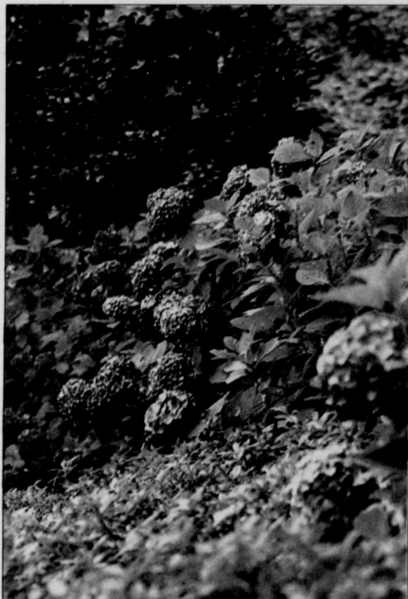
Homegrown chemistry comes in handy when adjusting the hues of your hydrangeas.