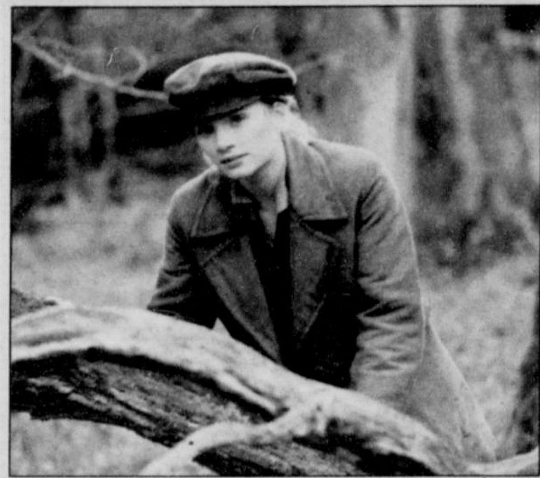
Kenneth Branagh's As You Like It premieres Aug. 21 on HBO.