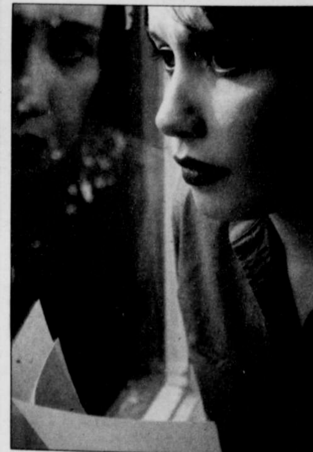
Theatre Vertigo stages A Doll's House Aug. 24-Sept. 22.