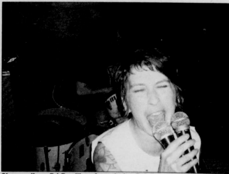
Sleepwalkers R.I.P. will perform during B.A.B.E. Fest.