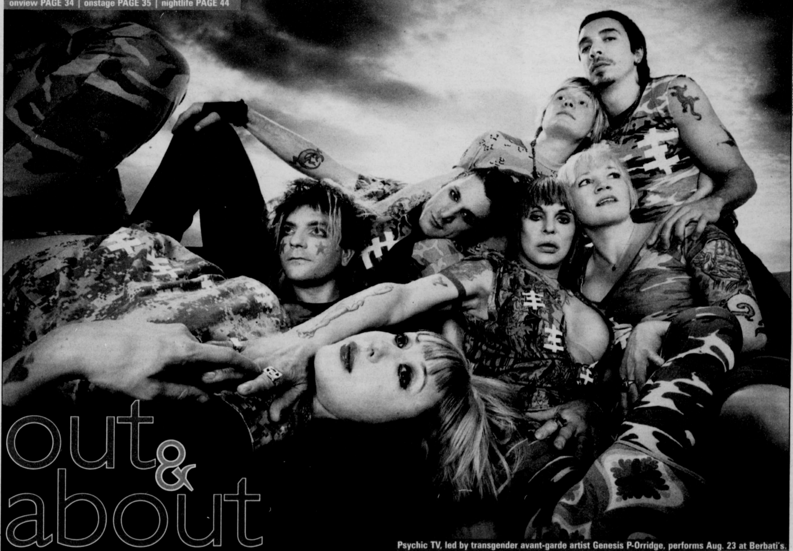
DAN MANDELL (WWW.DANIELMANDELL.COM)