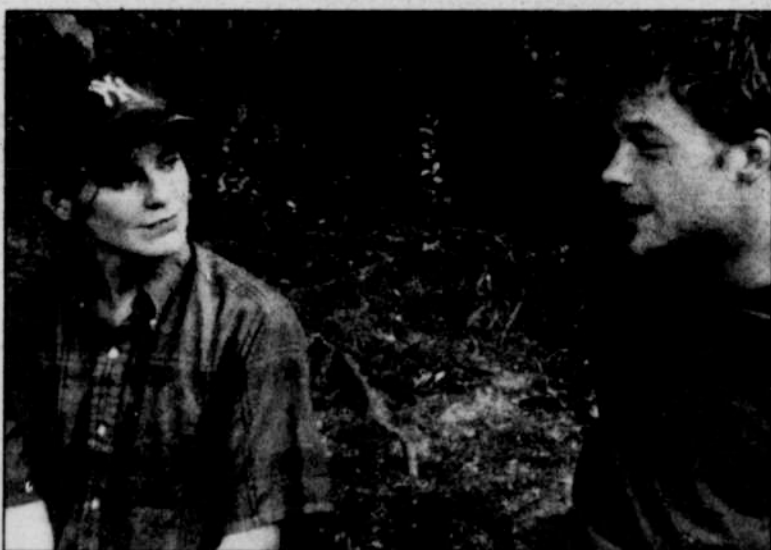
Northwest Classical Theatre Company stages William Shakespeare's As You Like It through Aug. 18.

The Tragedies present... And the Horse You Rode in On! —a sketch show that parodies everything from serial killers and MySpace to caveman politics and big pharmaceutical companies—through Aug. 4 at Crimson Theater. (8 pm. 700 NE Dekum St. $10 from 503-367-2100.)