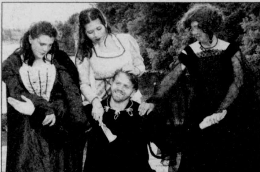
Masque Alfresco updates Molière's social satire The Misanthrope through Aug. 26 in Lake Oswego.

Northwest Children's Theater presents Summer Nights: A Musical Revue , bringing the best of Broadway to life with