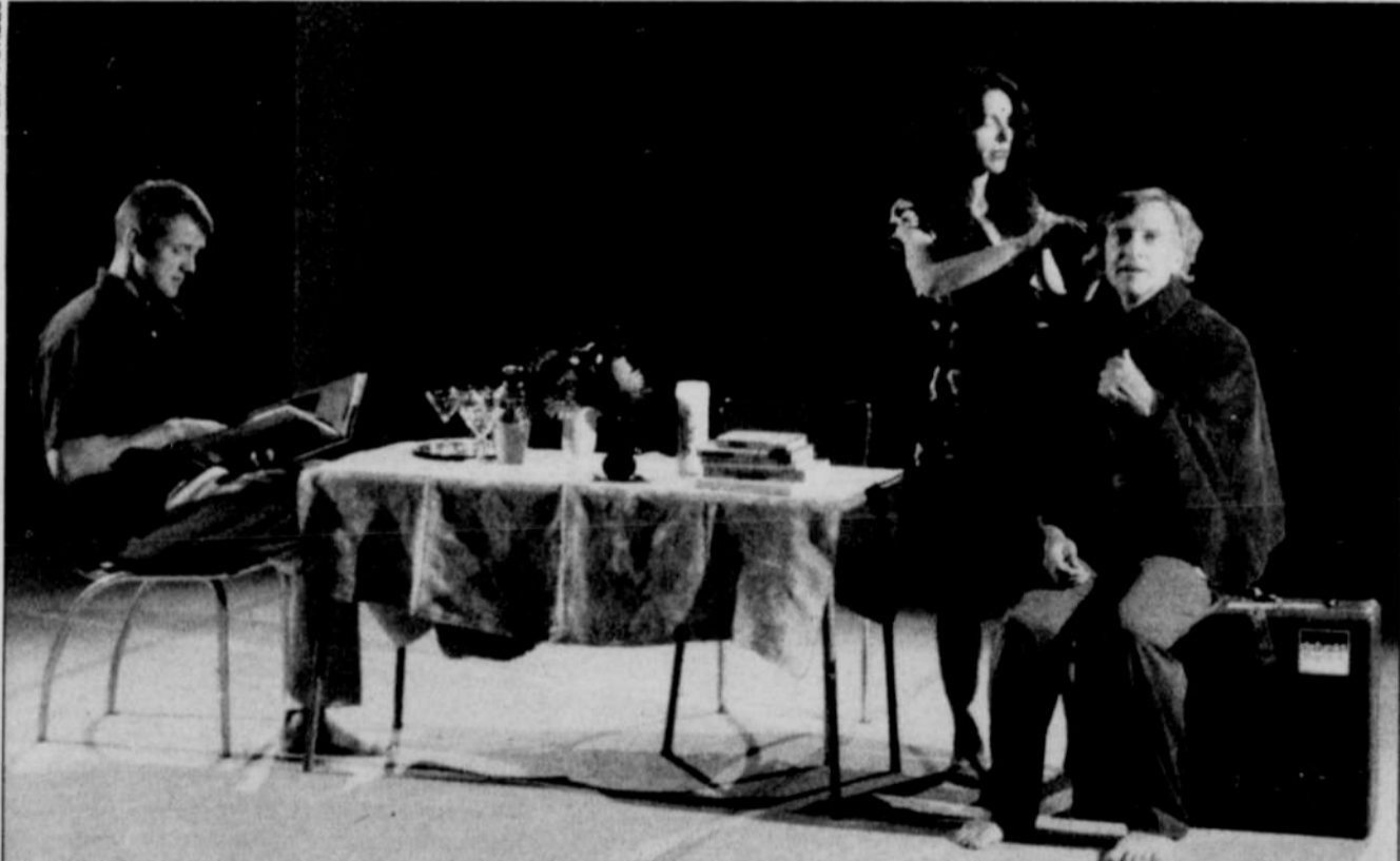
Performance Works Northwest presents the Richard Foreman Mini-Festival Aug. 17 and 18.

Working Artists Gallery presents Loaded Art! —an ongoing body of political/social mixed-media wall sculptures—Aug. 4-Sept. 1. Opening reception 6-10 pm Aug. 4. (2211 NW Front St. #301)