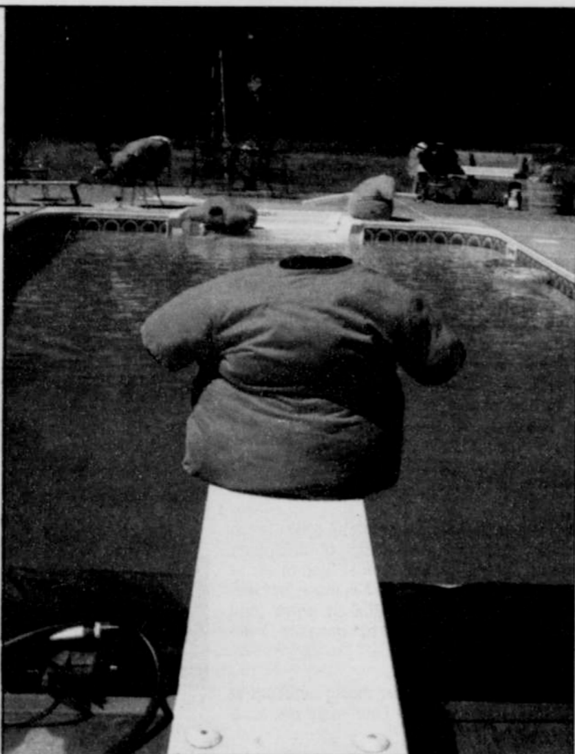
Help raise money for the literary and arts forum Gertrude Press on Aug. 17 at Q Center.