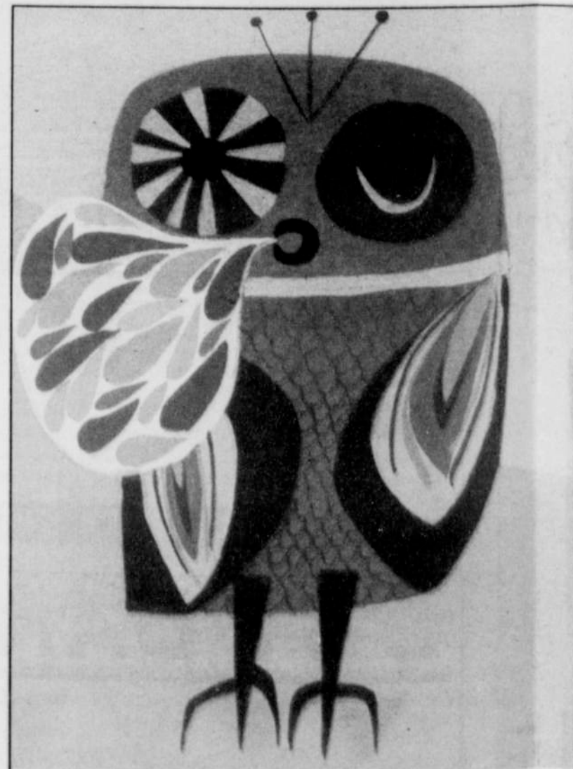
World-class illustrator Matte Stephens is on display through Aug. 26 at Office.

Someday Lounge presents esoZone , an underground arts and culture festival, through Aug. 12. (125 NW Fifth Ave. For a complete schedule of events, visit www.esozone.com.)