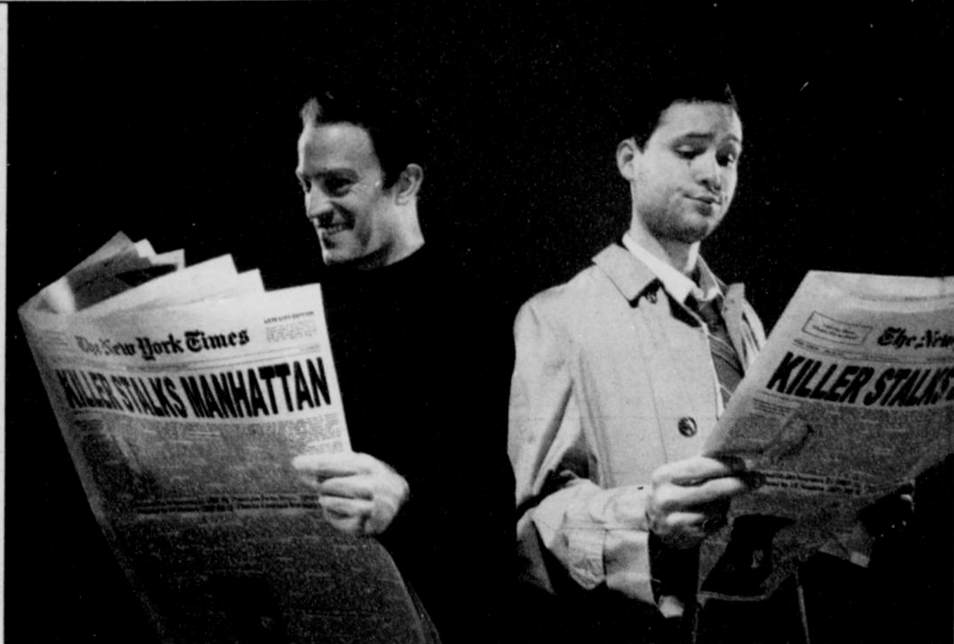
Broadway Rose Theatre Company stages the musical-comedy thriller No Way to Treat a Lady through Aug. 19.