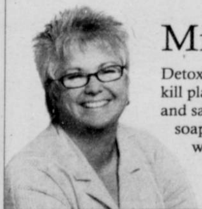
Festival of the Babes started during the summer of 1991 in San Francisco.