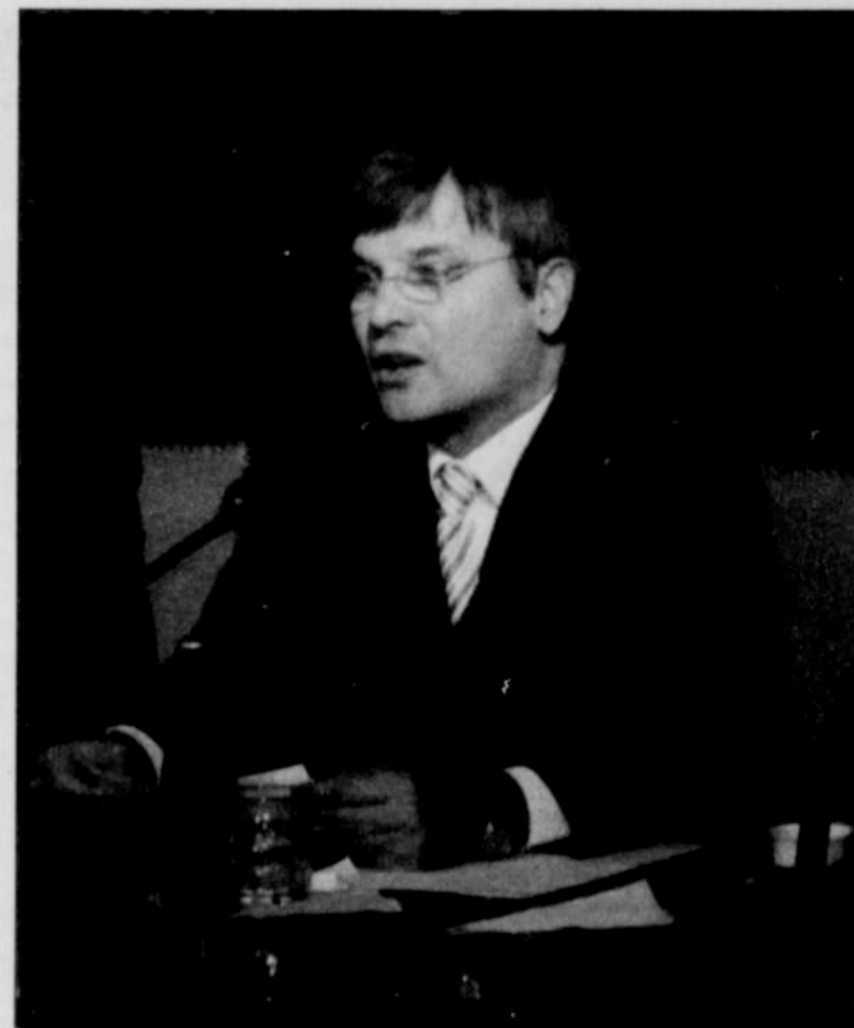
Budapest Mayor Demszky Gábor referred to gays when he said it was his duty to stand up for all who are persecuted in the Hungarian capital.

Outhouse provides office space to 70 sexual minority groups and contains a library and cafe.