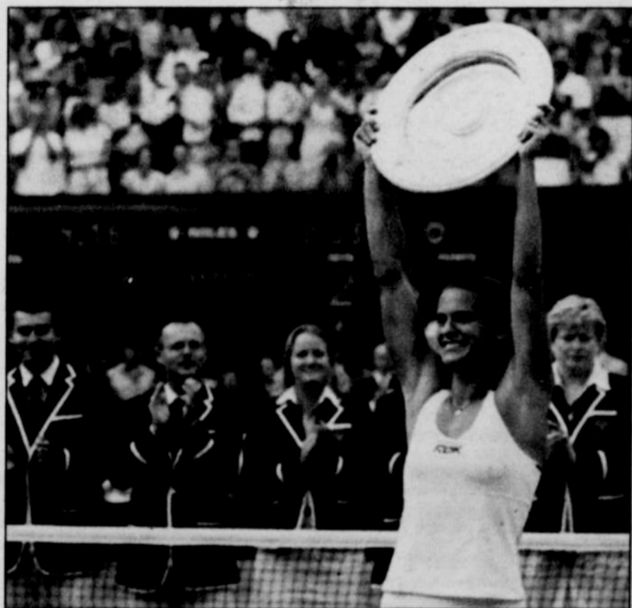
Amelie Mauresmo, last year's Wimbledon champion, is one of a few out and proud tennis pros.

As the new breed of gorgeous blond teenage Russian tennis pros climbs the ranks, and I say goodbye to old favorites (they're my age!) like Jennifer Capriati, Monica Seles and Lindsay