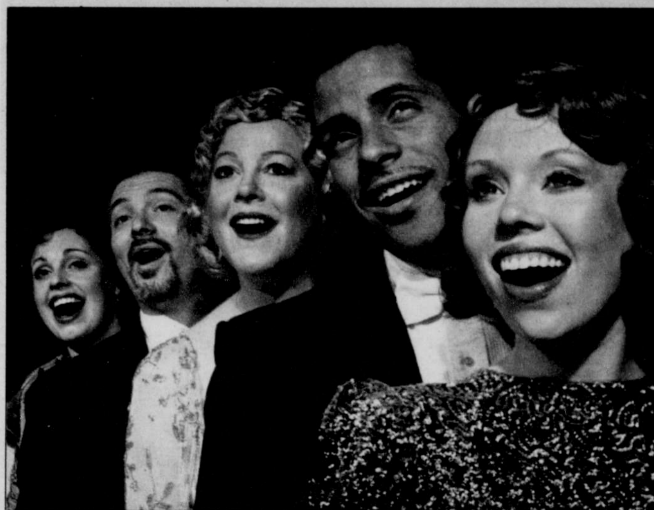
Broadway Rose Theatre stages a musical revue about Cole Porter through July 29.