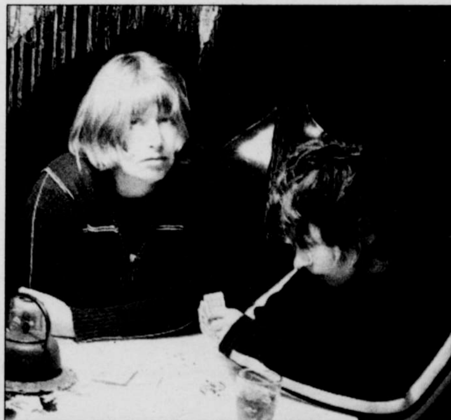
Myshkin's Ruby Warblers raise environmental awareness Aug. 3 at the Aladdin .

The Tragedies present ...And the Horse You Rode in On! —a sketch show that parodies everything from serial killers and MySpace to caveman politics and big pharmaceutical companies—through Aug. 5 at Crimson Theater. (8 pm Friday and Saturday, 700 NE Dekum St. $10 from 503-367-2100.)