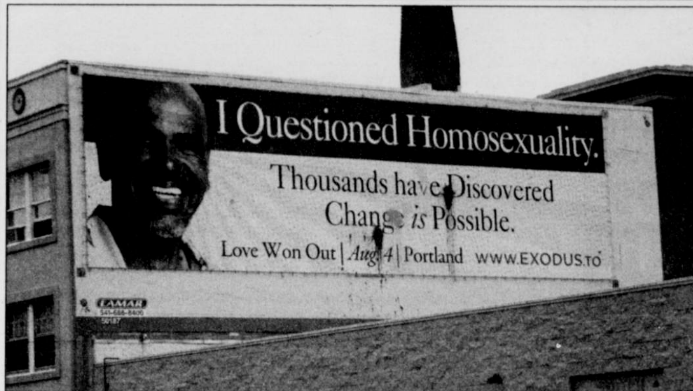
This billboard in downtown Portland warns that "ex-gays" are coming for a Love Won Out conference Aug. 4.

The Sexual Minority Youth Resource Center hopes to win "most popular" in a raffle with a huge payoff.