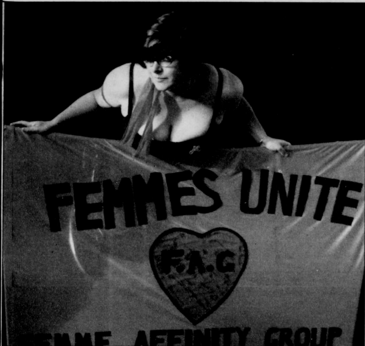
Femme Affinity Group PDX (F.A.G. PDX) unveils Crème de la Femme July 7 at In Other Words.