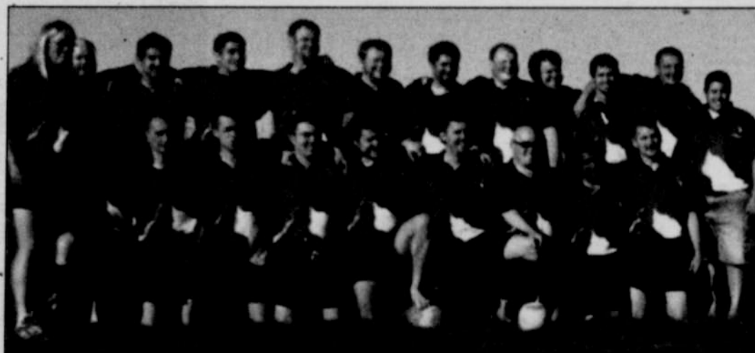
The Portland Avalanche is recruiting players for a 2008 tournament in Ireland.

The Edgefield Concerts on the Lawn Series in Troutdale welcomes back k.d. lang with Lyle Lovett and His Large Band . (6:30 pm. 2126 SW Halsey St. $45-$85 from Ticketmaster.)