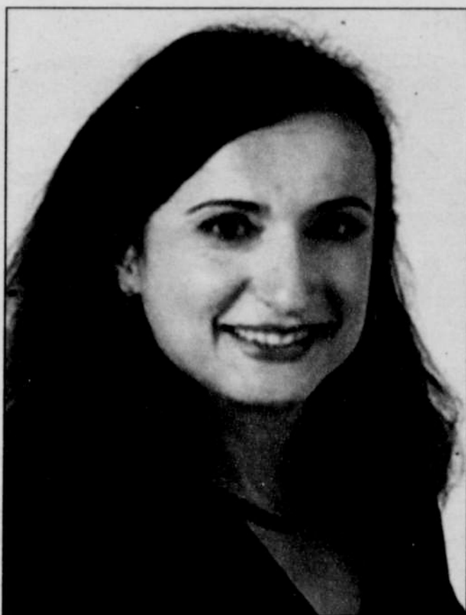
Italian transgender MP Vladimir Luxuria led Rome's Pride parade.

"This deal will have a huge, positive impact in Jamaica and the Caribbean," said activist Peter Tatchell, who coordinates the campaign from London. "Having these major reggae stars renounce homophobia will influence their fans and the wider