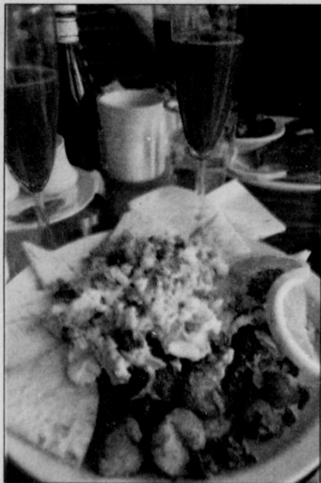
Zaytoon's new weekend brunch serves eggs enhanced with a sumptuously savory Mediterranean oregano pesto.