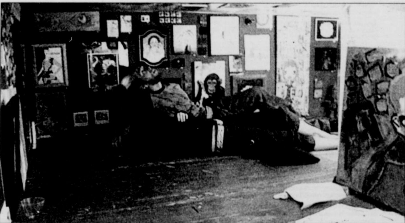
Enter if you dare: The Core, Portland's shortest walk-in gallery at only 3.5 feet high, presents the group show Voyeur through June 30.