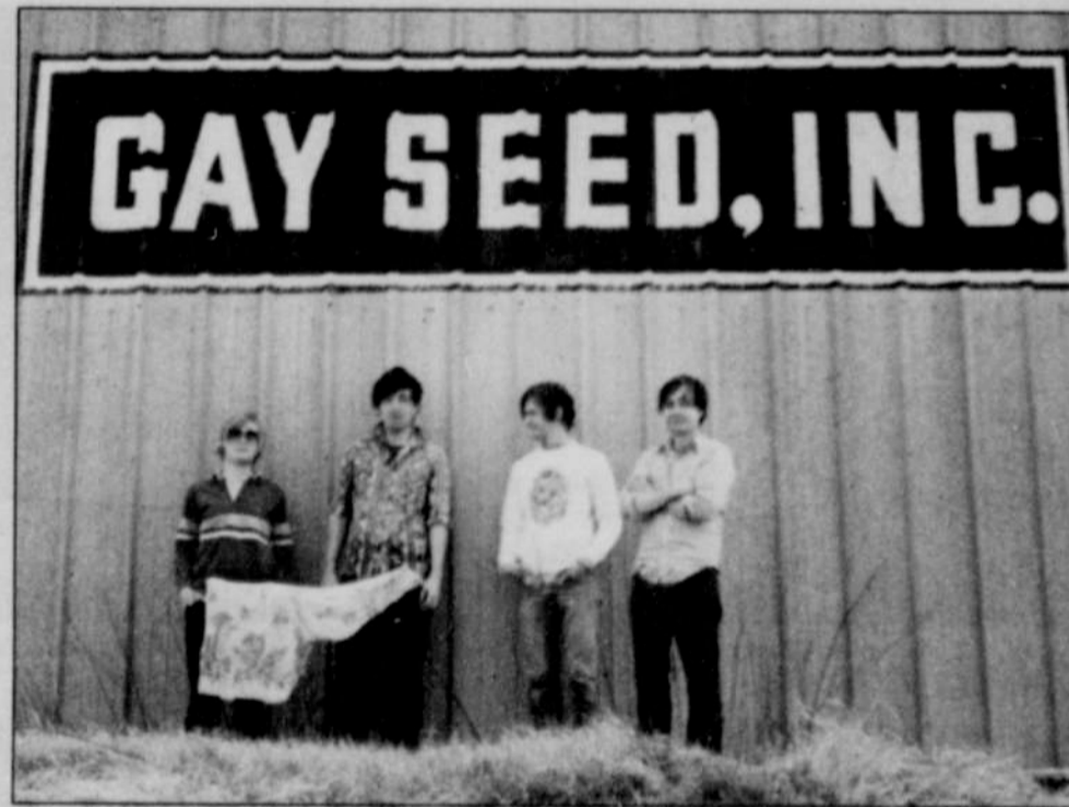
Grizzly Bear founder Ed Droste (second from left) shies away from rock star self-aggrandizement.

Droste (rhymes with "toasty"), who is gay and in a long-term relationship (and happens to be the cousin of Pink Martini chanteuse China Forbes ), is more or less the band's frontman but, in typical indie style, shies away from rock star self-aggrandizement. He's quick to point out that the band's second album, unlike its 2004 debut, Horn of Plenty , was written not by him alone but collaboratively, with contributions from all four members. The band recently played a number of festivals, including Coachella, All Tomorrow's Parties in England and the just-concluded Sasquatch Festival in George, Wash. Of these, Droste says, "Coachella was great just for how huge it was, Sasquatch had the most beautiful scenery, and we played the best at ATP."