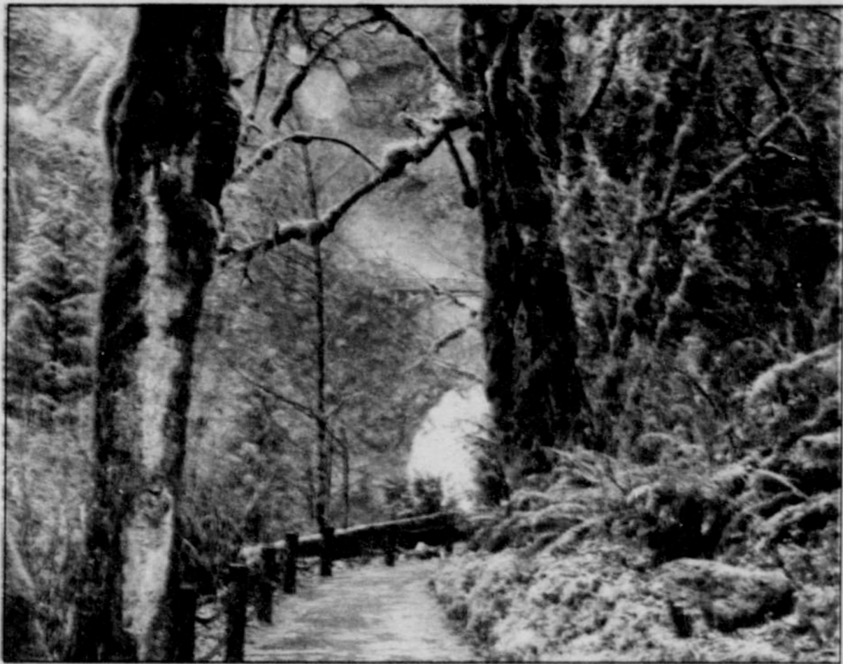
Staff Pick 'Untitled' by Eric Roberts

Most Oregonians recognize this picture as the trail to Multnomah Falls. The teasing glance of white water coming from beneath the bridge speaks not only of the peacefulness and beauty of an autumn day, but of anticipation of walking up the winding trail that leads to that historic bridge. So many of us have stood on that bridge, gazing on one of the best vistas the falls has to offer. A few souls choose to continue that trail as it winds to the top, a climb that will prove there is a much less photographed view of that great landmark. This point is where the peaceful river becomes the powerful falls. The story this photo tells me is about peace, perspective and a real Oregon experience.