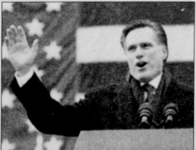
Mitt Romney no longer supports the repeal of the military policy known as "don't ask, don't tell."