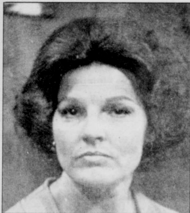
Florida is marking the 30th anniversary of Anita Bryant's anti-gay crusade.

a catalyst for the community to organize national-ly and fight back.