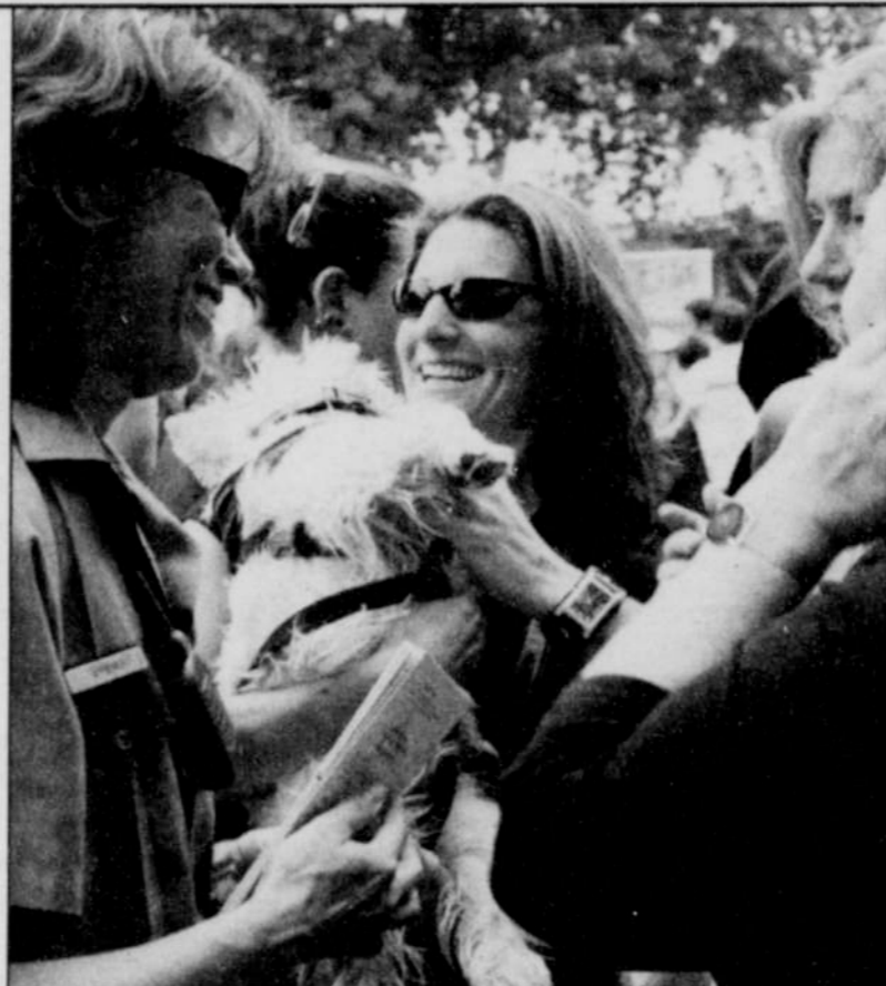
A police officer discusses community safety with revelers.