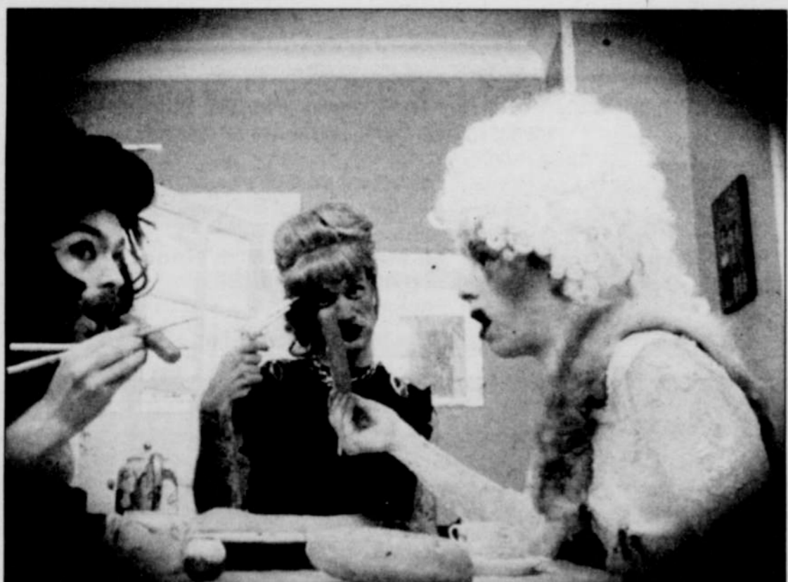
Splendor and the Gender Fluids outwit and entertain with subversive style.