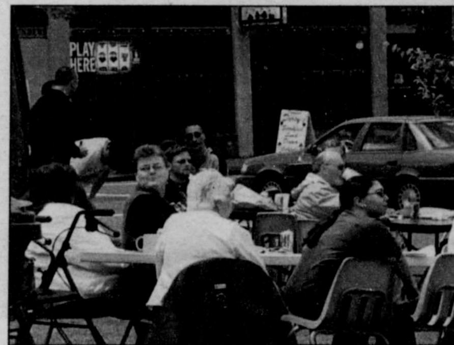
North Portland residents celebrate Pride in 2005.

All proceeds from the event support the community center. For more information visit www.abdellis.org .