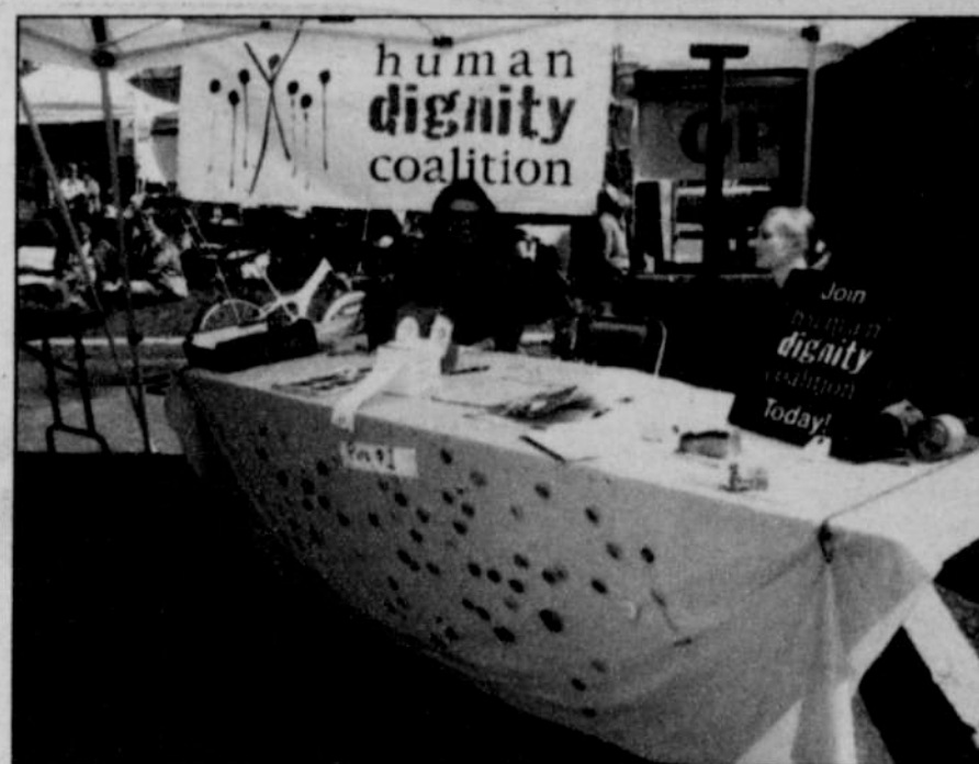
The Human Dignity Coalition will return to Bend Pride.