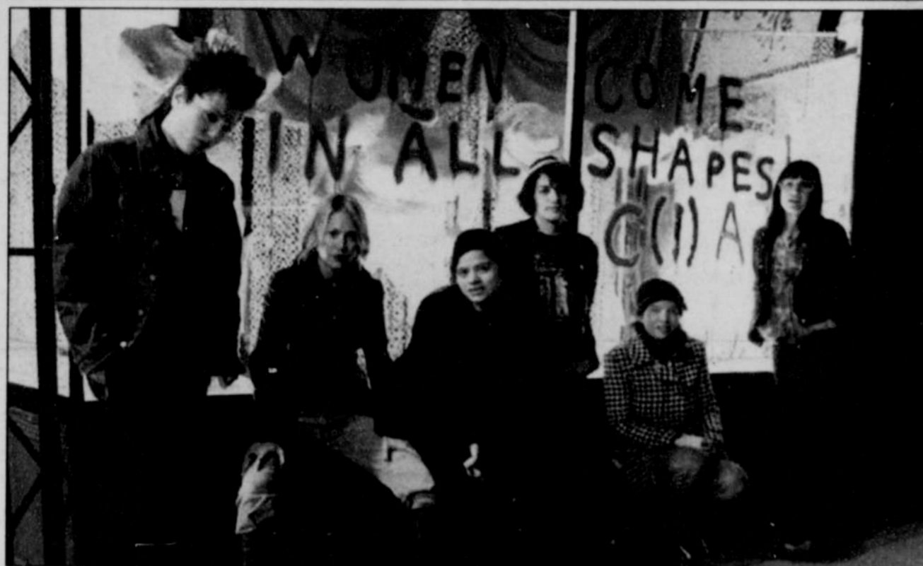
The cast of Itty Bitty Titty Committee will make you want to touch the celluloid.

the South by Southwest Film Festival and the best narrative feature audience award at the Melbourne Queer Film Festival.