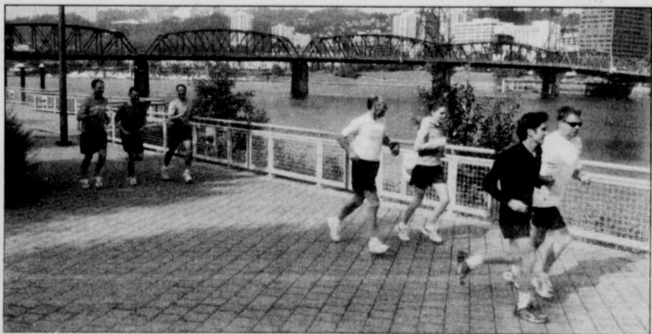
The queer community gears up for a full weekend at the 2007 Pride Family Fun Run.