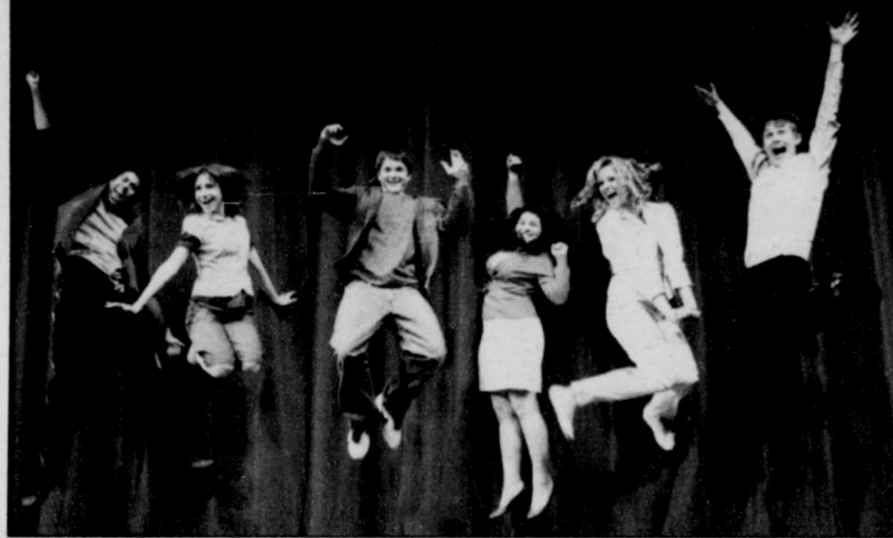
Blue Monkey Theater Co. stages Disney's High School Musical through May 27.

in confined space and full plate of performance art for a diverse audience—at Bluehour. (7:30-10 pm. 250 NW 13th Ave. $15.)