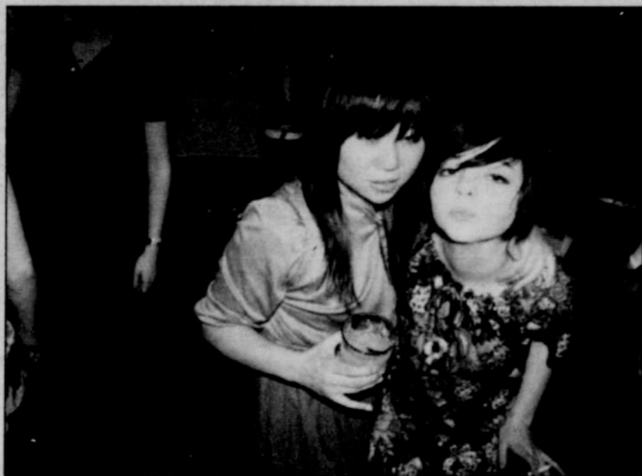
The Thin Pink Line is a reckless dance party thrown every second and fourth Friday at Rotture.