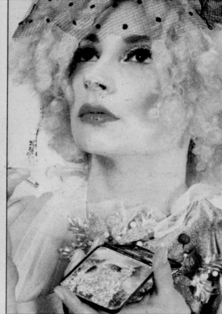
"Glitter Decadence" is part of the group show All That Glitters Is Good , opening June 1 at Night Light Lounge.