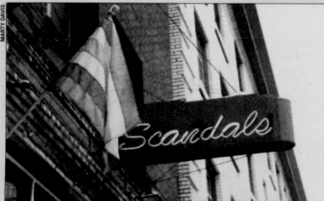
Scandals throws an all-day brunch party every Sunday.

My only complaint: What's with not taking debit cards? I had to leave my barely touched liquid breakfast on the table and run across to Powell's, only to find its ATM machine out of order. I ended up walking to Whole Foods, buying $25 worth of groceries and getting cash back in order to avoid paying a couple of dollars in ATM fees, which may or may not be slightly ridiculous. But like the end of an adult fairy tale, my Bloody Mary and chicken tenders were waiting on the table when I got back, none the worse for the wait.