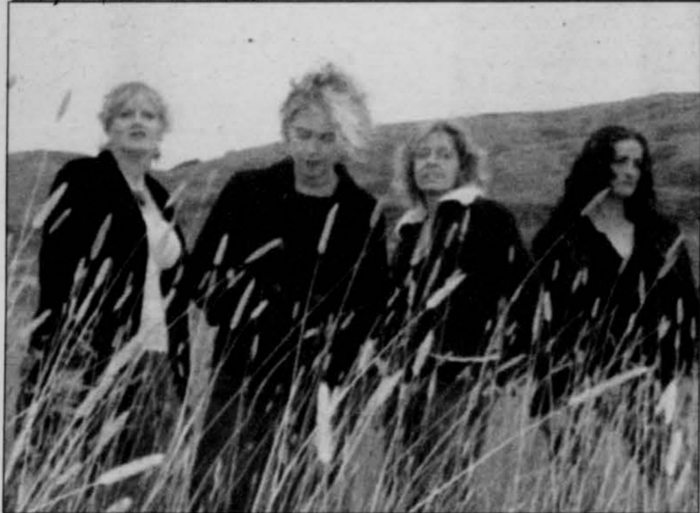
Blame Sally performs April 18 at Mississippi Studios.