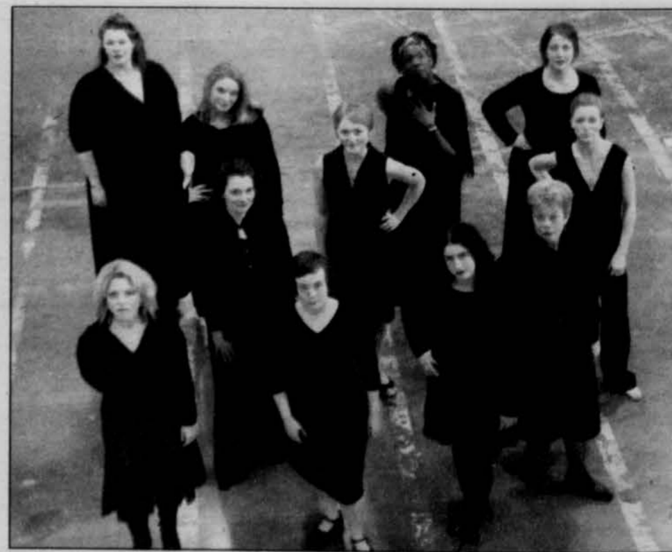
The monologues of Other Women celebrate fascinating, frank, funny and furious females who defy convention.