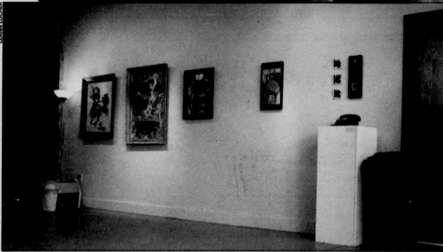
Top: Monthly family playdates are a big hit with the parents. Middle/bottom: "What Is Queer Art?" kicked off Q Center's arts and culture programming with 200 attendees.