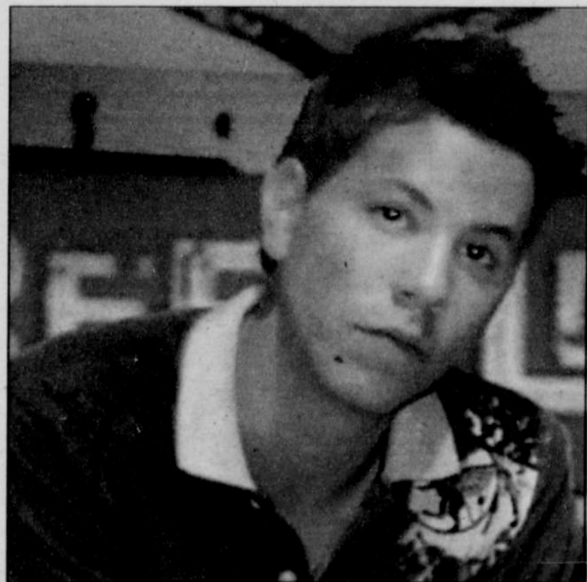
Mexican pop star Christián Chávez of RBD came out to fans on his band's Web site.