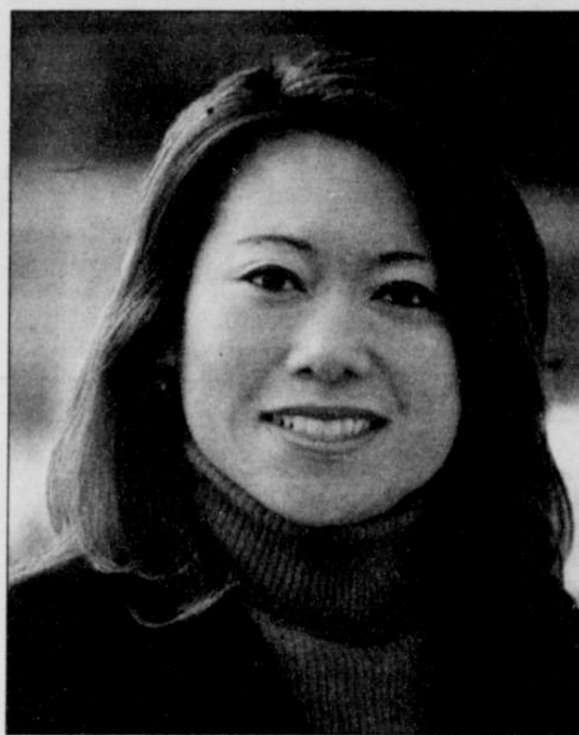
Fiona Ma, D-San Francisco, authored the Name Equity Act, which gives couples the opportunity to change their surnames when they marry or register as domestic partners.

As of Jan. 1, 265 of the Fortune 500 corporations offered health benefits to employees' domestic partners, more than twice as many as in 2000 and more than a 10-fold increase since 1995.