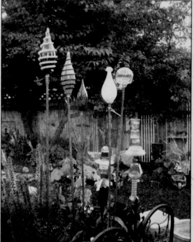
Yesterday and Tomorrow, a garden art wonderland, features many Portland artists' work, including twisted glass cones on stake finials.

A contributor to the Hot Flash New Year's Eve dances and other community auctions, Kubon is