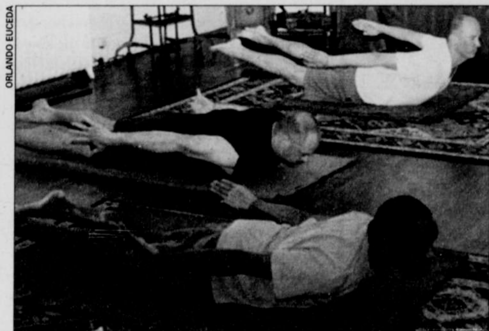
Q-LAND teaches core strength and therapeutic yoga classes.

For more information about MENSPIRIT visit www.qland.org and www.lovetribe.org/menspirit .