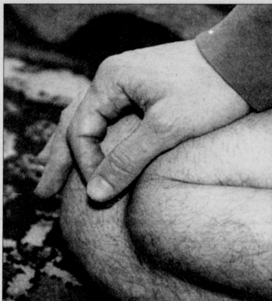
A recent MenSpirit event called ShadowQuest used meditation and other methods to help participants "develop their innate courage and safety in dealing with repressed, shunned parts of themselves."

He is particularly excited about a recent