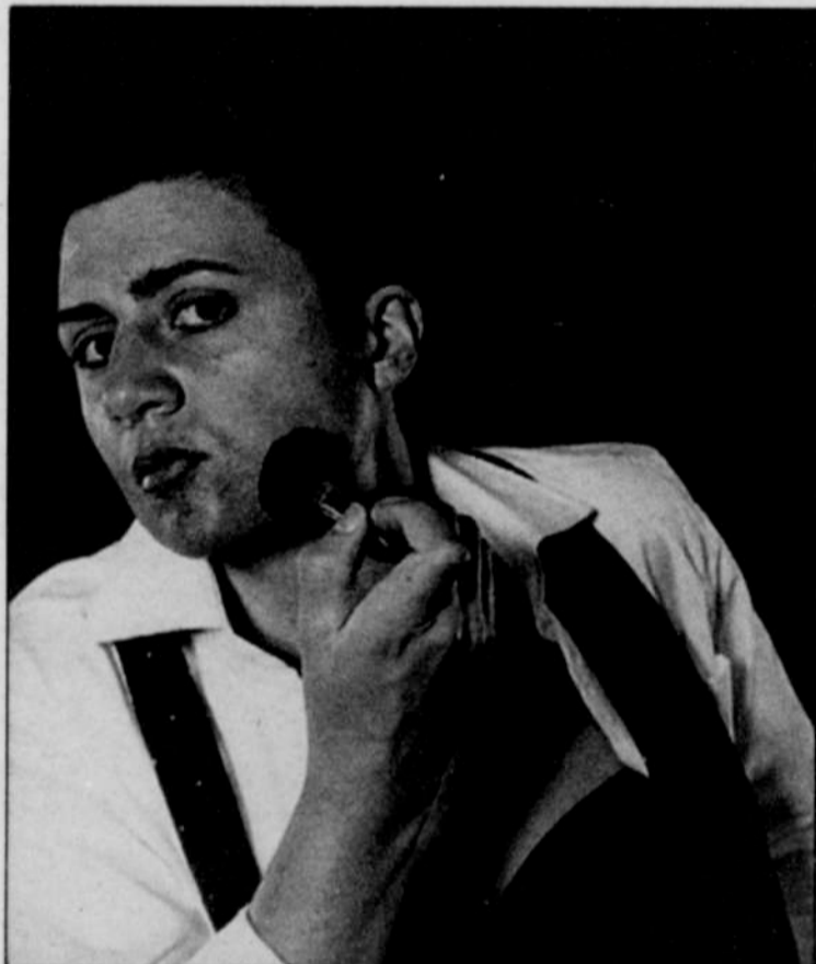
Norah Vincent reads from Self-Made Man Jan. 25.

Out Dancing's intermediate nightclub two-step class starts tonight and continues every Friday in February at Ankeny Street Studio. Beginning West Coast swing class follows. (6:15-7:15 pm two-step [$32 for month], 7:15-8:15 pm swing [$24 for month]. Southeast Ninth Avenue and Ankeny Street. 503-236-5129. www.outdancing.info.)