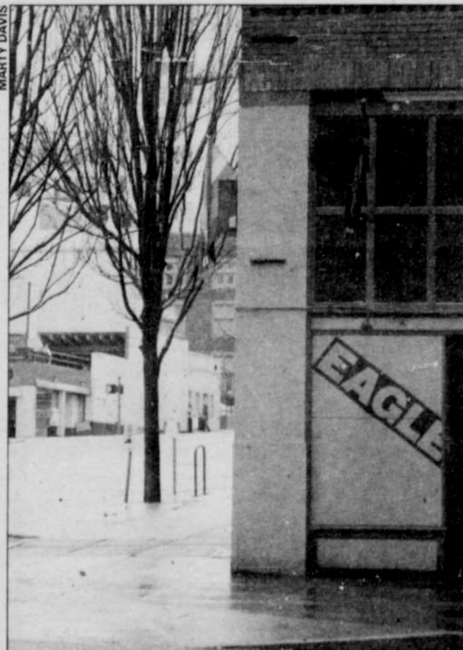
The Burnside Triangle will lose a landmark when the Eagle PDX moves to Old Town.