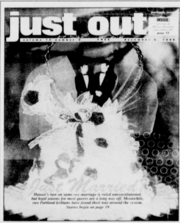
Hawaii's ban on same-sex marriage is ruled unconstitutional, but legal actions for most queers are a long way off. Meanwhile, two Portland lesbians have found their way around the system. Stories begin on page 19.